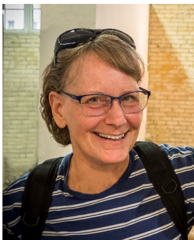
AUTHOR SUSAN AUNE

Truly they are better together - after all, lives depend on it!